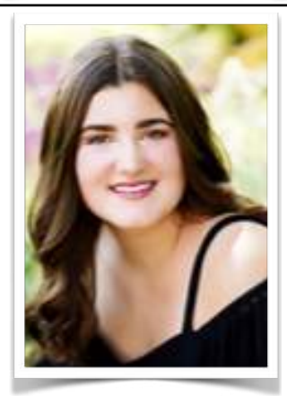
OSLC Voice - June 2023