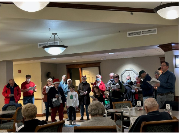
Our Savior's held its annual caroling day a couple weeks before Christmas. They visited four local retirement communities and were well received.