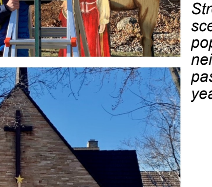
Some family volunteers helped set up our nativity scene out on Commercial Street. This scene has been popular with our neighbors and passersby for years.