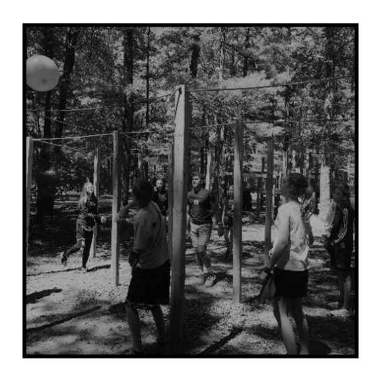
Some of our youth play a team building game at Confirmation Camp.

Thanks to our generous congregation for their prayers and support for making camp a reality for our kids.